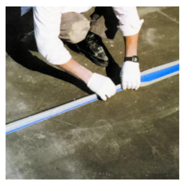
An example of waterproofing an expansion joint on a terrace