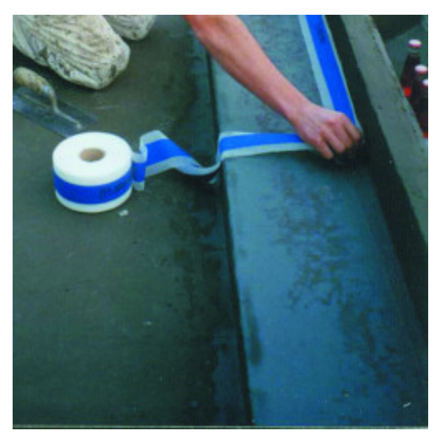
An example of Mapeband waterproofing a corner between the bottom and a side of a bath tub